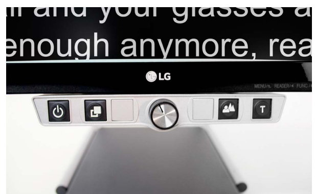
Easy to use function keys on the front.