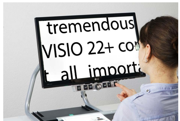
The aesthetically pleasing and space-saving design fits all environments.